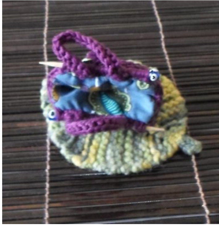
Intérieur Le sac, vue de la doublure.