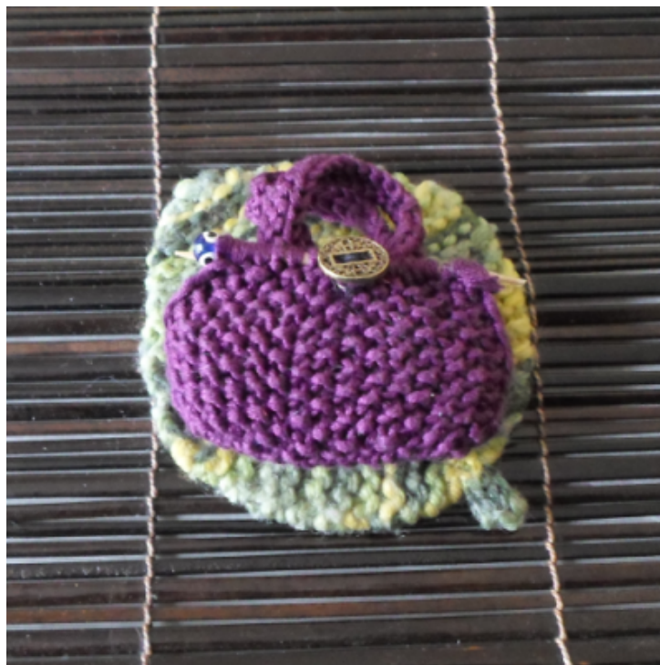
Sac miniature à aiguilles Le sac mesure environ 6 x 5 cm sans les poignées.

To make it, you will need scraps of dk or fingering yarn with 2.5 mm needles, a snap and a button, 2 toothpicks, 2 beads, glue and sand paper for the "needles" plus a piece of fabric for the lining if desired.